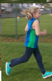
The first of several cross country running events this year—great results