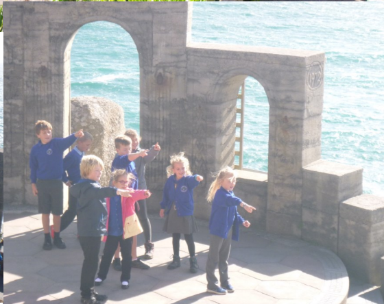
Godrevy class visited the stunning location of the Minack Theatre for a workshop with an amazing backdrop