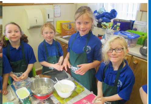
A touch of Bake Off came to Kynance class with some delicious bread making