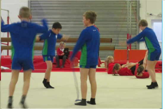
Gymnastic competition at Phoenix gym organised by CSIA