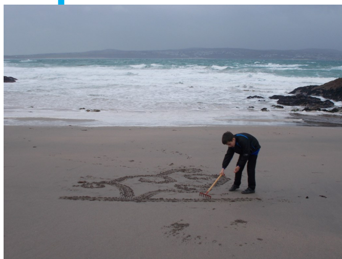
Beach Art with Rinsey Class