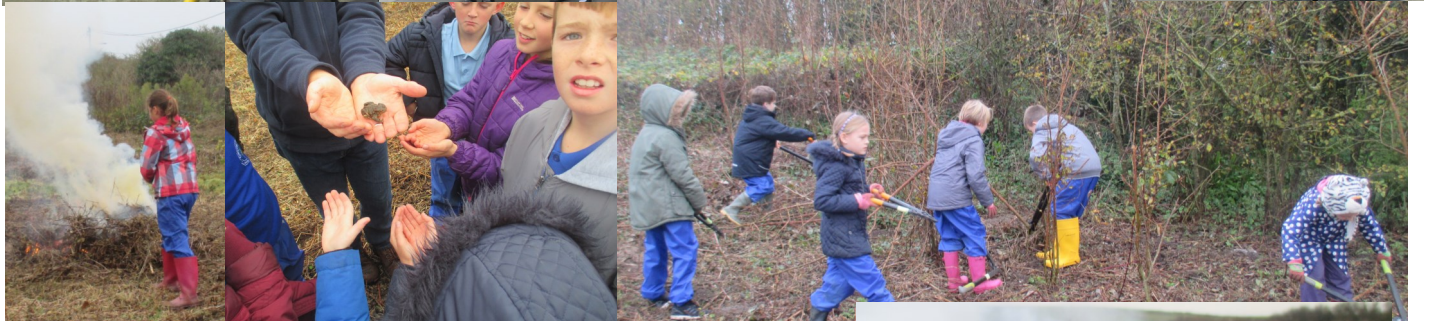
Godrevy Class visit Gwithian Green, search for beasties and cook their own lunch